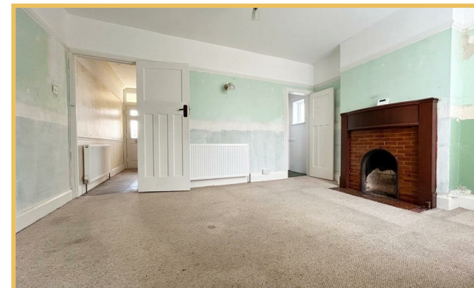
Friars Street Shoeburyness, Southend-On-Sea SS3 9BG