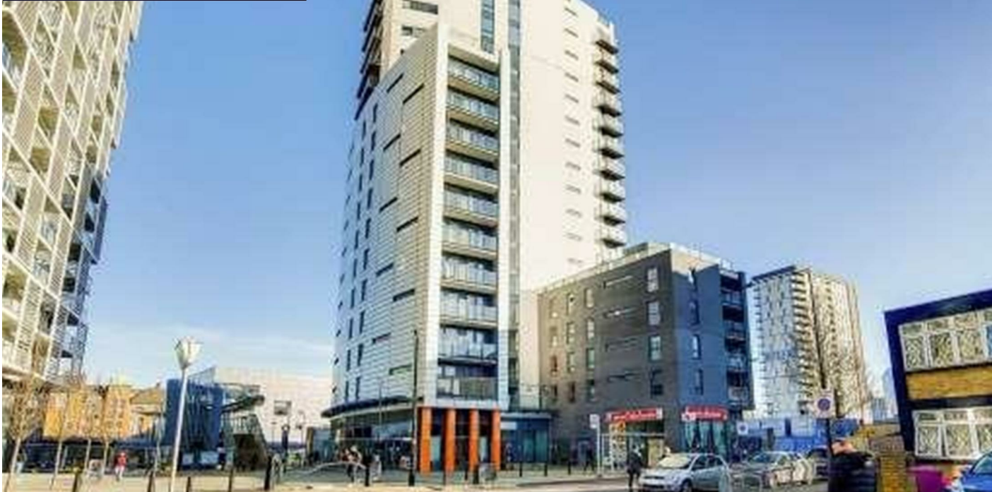
Crisp Street , London E14 6ET