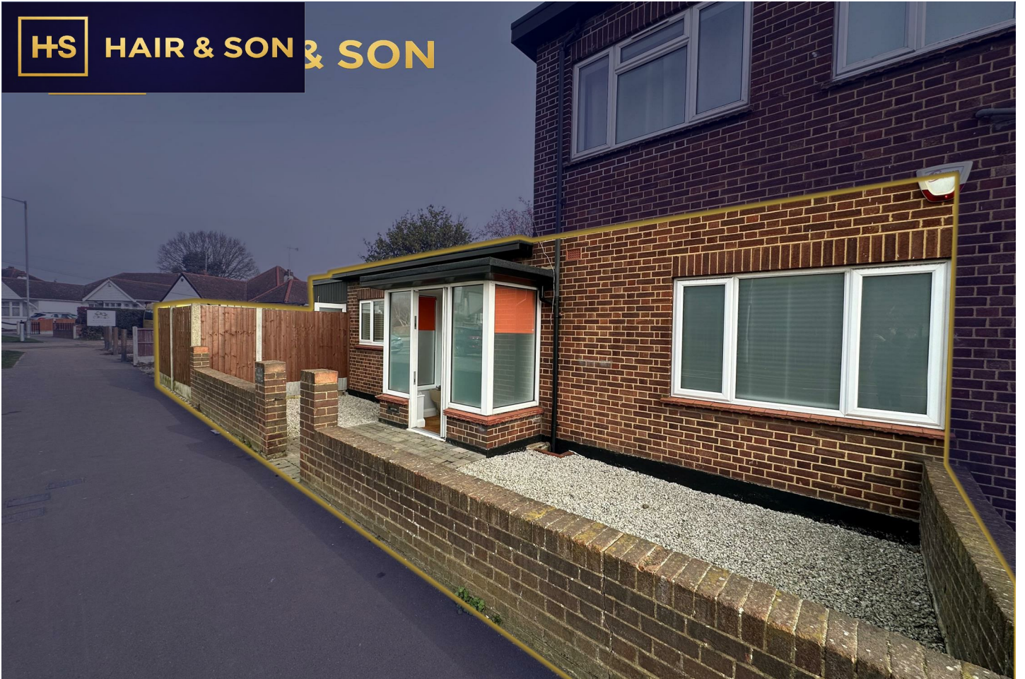
Eastwood Road North Leigh-on-Sea, Essex, SS9 4LT